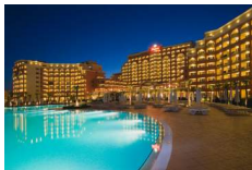
Majestic, Sunny Beach