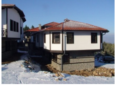
Ovinache Holiday Village, Bansko