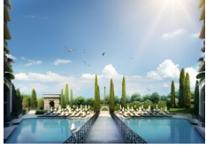
ROMANCE PARIS, St. Vlas