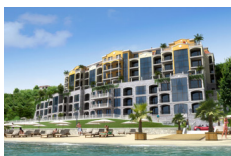
White Pearl, Kavarna