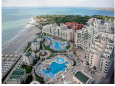
Sunset Resort phase II, Pomorie