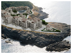
White Diamond Luxury Resort, Carevo