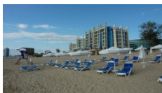
Blue Pearl, Sunny Beach