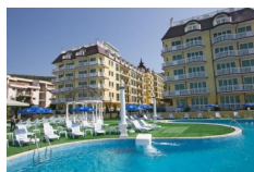
TALIANA BEACH, Elenite