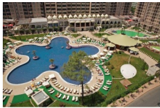
Royal Beach, Sunny Beach

parasem 69,75 m 2 i korytarzem 7,02 m 2 DONUS - parking