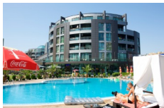
Sunny Beach Plaza, Sunny Beach