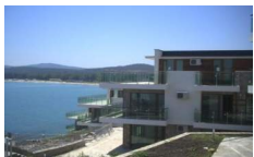
Panorama Bay Apartment, Sozopol