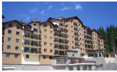
Rodopi Pearl, Pamprovo