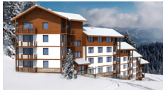
Forest Glade, Pamporovo