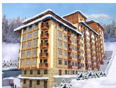
Royal Pamporovo, Pamporovo