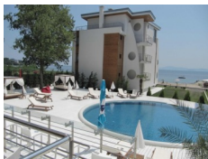
White Sails, Pomorie