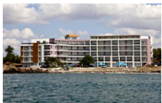
Vilmar Beach , Pomorie