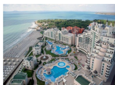
Sunset Resort phase II, Pomorie