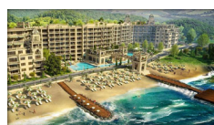
Rich Daddy, Pomorie