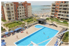
Helios Pomorie, Pomorie