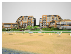
Crotiria Beach Complex, Pomorie